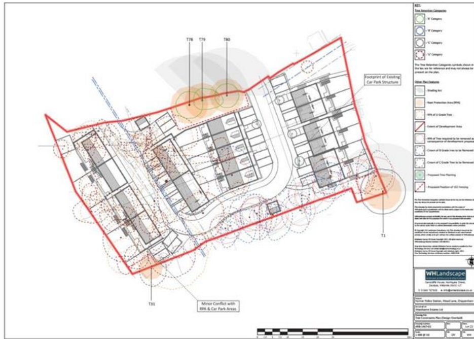
All 'A category trees' are retained