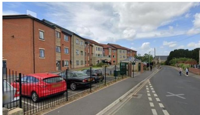
Care Home on Wood Lane

9.13 In terms of density of the proposal, the site area is approximately 0.45 hectares for the proposed 17 dwellings, i.e. approximately 37.8 dwellings per hectares. While the proposal would not be a low-density development as to the previous approved scheme, the proposed density would not be out of keeping with the urban character of this particular location given the proximity of the adjacent properties.