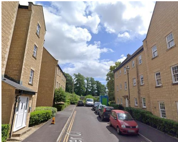
View from Fuller Close looking into the site