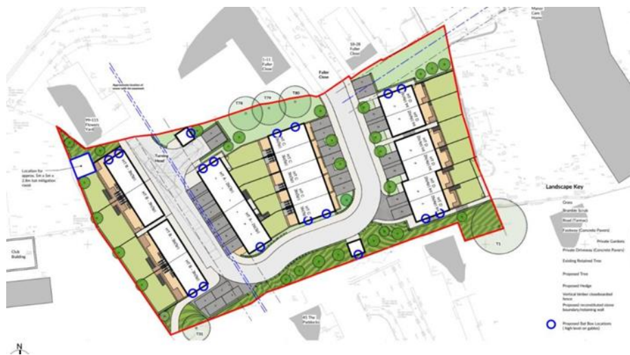
Tree planting in the proposed landscape strategy

9.35 The Arboricultural Officer has reviewed the submitted details and noted the reasons of removal of some trees on site. 81 trees have been surveyed on or adjacent to the site. The species consist of Sycamore, Ash, Goat Willow, Alder and Lime.