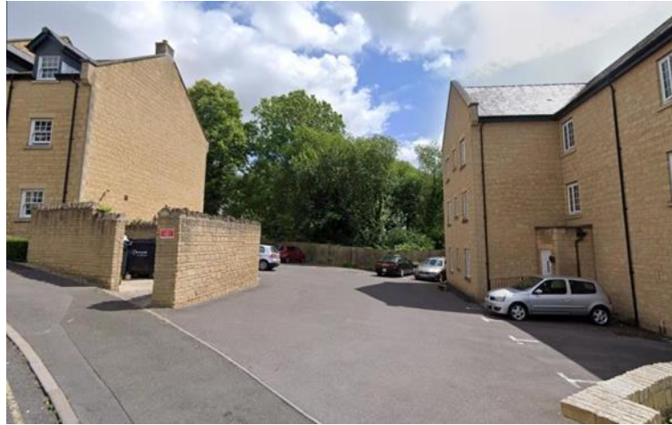
View from Flowers Yard looking into the site