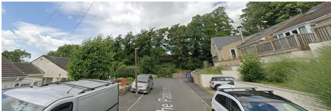
View of The Paddock looking into the site