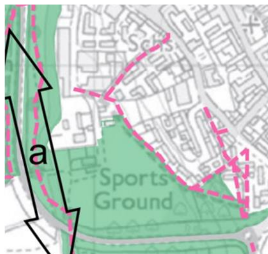
Existing footpath network